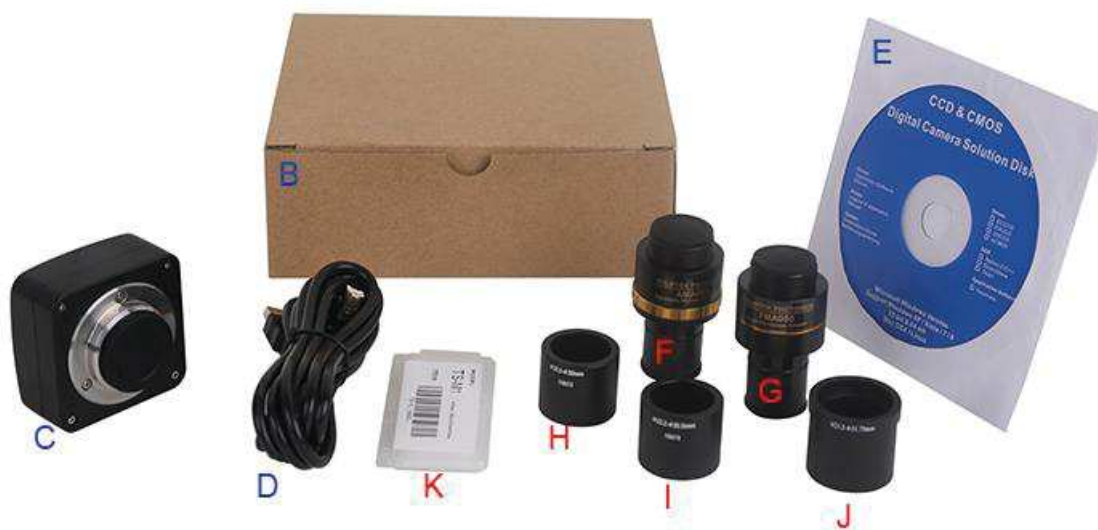
Packing Information of UA